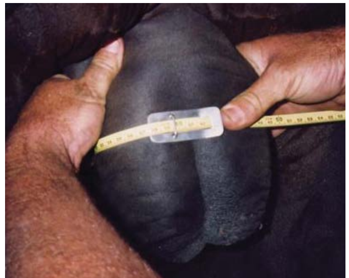
Figure 1. Measuring Scrotal Circumference

Bulls selected for high SS EBVs are expected on average to breed daughters with earlier puberty and with shorter days to calving.